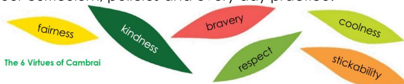
The 6 Virtues of Cambrai

Our school motto is more than words on a page; we live it, promote it and teach it. 'Growing good people – doing great things' is at the heart of all of us at Cambrai Primary School. Aligned to this are our six virtues that are interwoven through our curriculum, policies and every day practice.